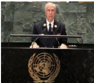
United Nations Global Congress of Victims of Terrorism 2022 (My speech begins at 11 minutes into the video.) Speech to over 100 countries from the UN General Assembly Hall