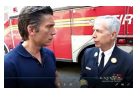
ABC News with David Muir 7/11/18 1st FDNY Battalion Chief to enter the North Tower on 9/11 is retiring