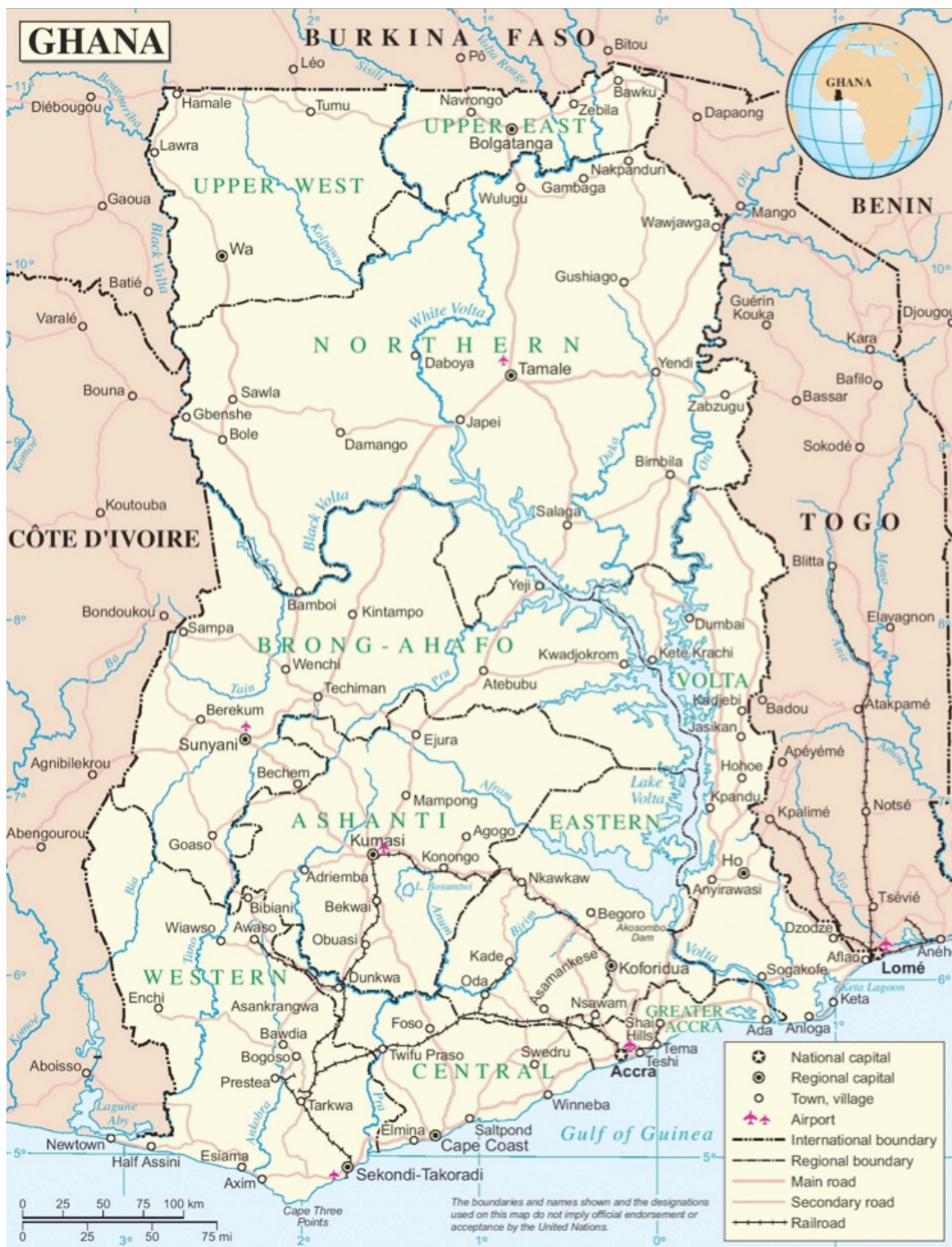
Map of Ghana. 4